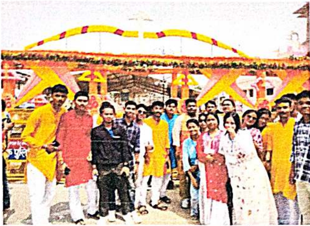
At the entrance of Ram Mandir