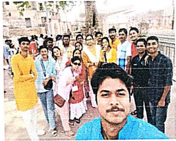
Inside the premises of Ram mandir