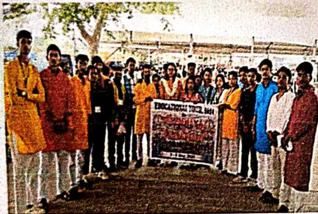
Inside Ram mandir premises