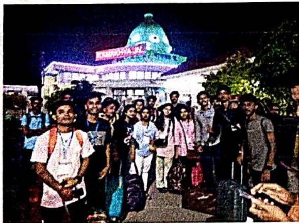
At Kamakhya Station

On May 7, 2024, they checked out of their hotel at 8:00 AM and began their return journey from D.D. Upadhyaya to Kamakhya by Brahmaputra Mail, departing at 11:11 AM. The group reached Guwahati at 3:00 PM on May 8, 2024, settled into a hotel, and had lunch. The final leg of their journey from Guwahati to Silchar started at 6:00 AM on May 9, 2024, arriving in Silchar at 9:00 PM. The total excursion ran smoothly and everyone reached their home safely and merely.