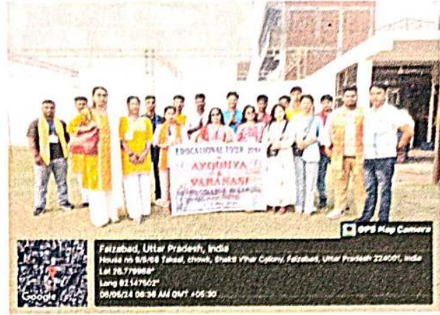
At Ayodhya guest house