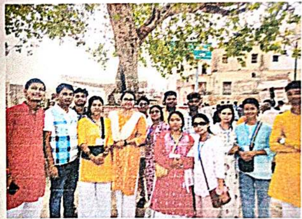
Inside Ram Mandir premises