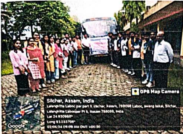
At College premises before the start of Journey