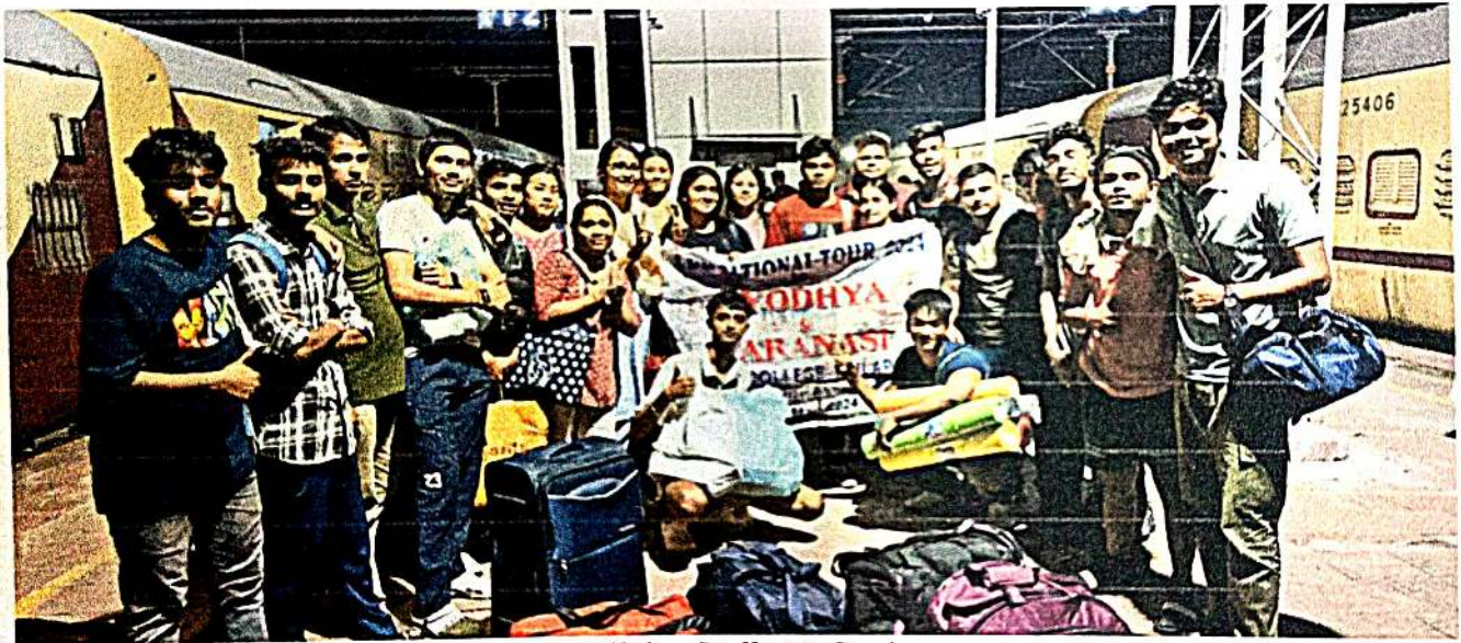
At Silchar Railway Station